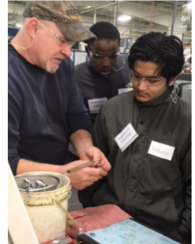
Above: Schneider Packaging Equipment hosted students from the Syracuse P-TECH Program, showing them the robotic equipment that they design for their customers globally.