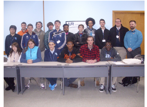
Students from Bishop Grimes visited United Radio and learned about IT, software development, and how they repair drones.

Partners for Education & Business, Inc. (PEB), partnered with 14 business members of the Technology Sector and the CNY STEM Hub, coordinated the first CNY STEM Job Shadow Day on February 2nd. Over 230 students and teachers from 14 local schools and programs spent several hours visiting local businesses with the goal of learning about STEM careers by observing jobs being performed in the workplace. The companies opened their doors to student groups that had been previously “matched” to their business by students’ career interests.