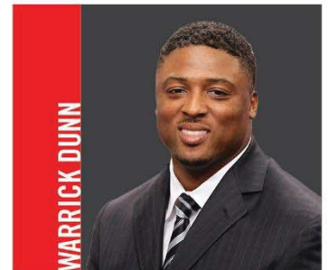
WARRICK DUNN Former NFL Running Back, Partner of the Atlanta Falcons