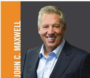
JOHN C. MAXWELL Leadership Expert, New York Times Bestselling Author, and Coach