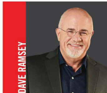
DAVE RAMSEY Personal Money-Management Expert, Bestselling Author