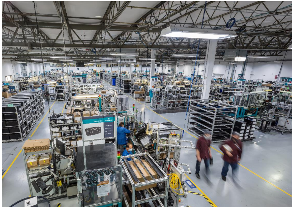
MQ_Production1.tif: Marquardt's 95 year history in creating a wide range of products and systems has positioned the company as a local leader in development and manufacturing services.